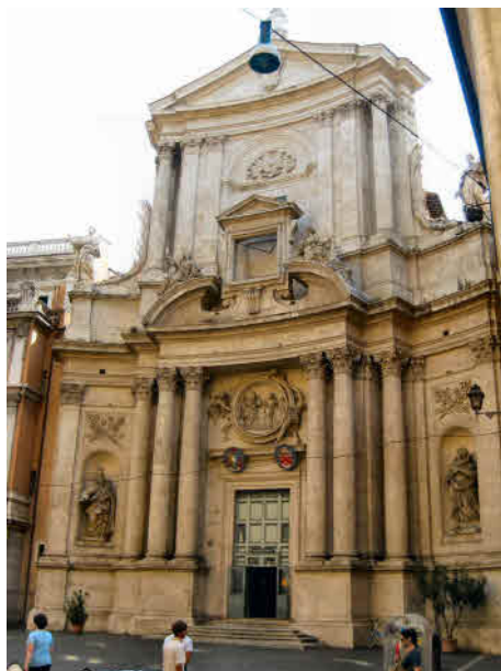
San Marcello al Corso

Curiously, this church was not noticed by the Einsiedln pilgrim in 800 4 , although Pope Gregory III (s 731-741) had made major improvements to it not very long before his visit (and the church is included in the Mirabilia Urbis Romae of 1143 5 ).