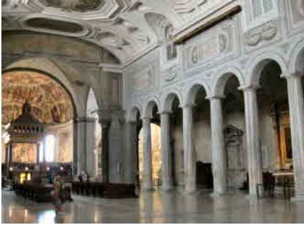
San Pietro in Vincoli: the nave