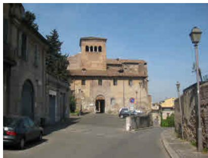
SS Quatro Coronati