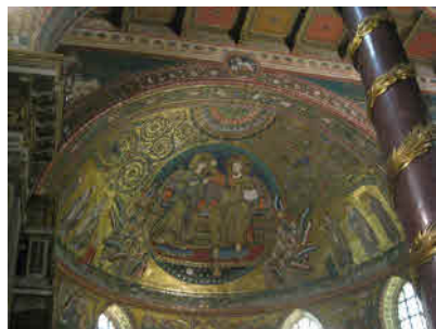
and the apse mosaic