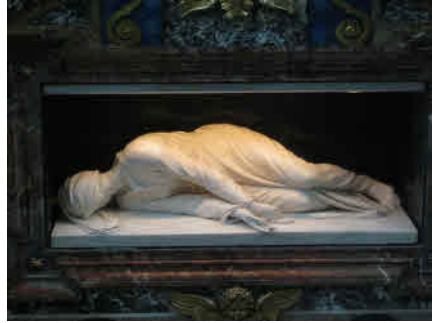
and the figure of the saint

Approached through a garden courtyard, Santa Cecilia is a cool and lovely spot, one of those which take your breath away for a moment, when you enter, leaving you standing in quiet awe at the grace and beauty of the space before you.