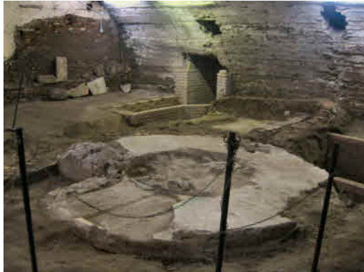
Remains of the 5 th century baptistry below the present church

In terms of location, the church was built close by the Via Lata, the continuation down to the Forum of the Via Flaminia, a little north of the column of Marcus Aurelius, adjacent to the Ara Pacis of Augustus, and covering part of the same emperor's massive Horologium. The gnomon of this great sun-dial, originally an Egyptian obelisk, was still standing in 800 when the Einsiedler included it in his Itineraries, and though it was lost thereafter, it was rediscovered late in the 18 th century and re-erected in the Piazza di Montecitorio, some 100m south of its original position, where it still stands – with moreover a line of brass strips set into the paving to record the length of its shadow at different times of the year, so that it still retains part of its original function. One could hardly have found a more significant spot at which to declare Christianity's supersession of Imperial Rome.