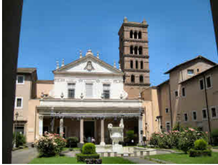
Santa Cecilia in Trastevere, the façade