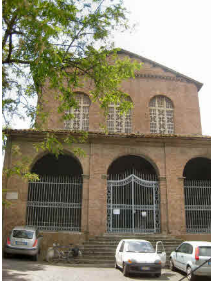
Santa Balbina, the façade