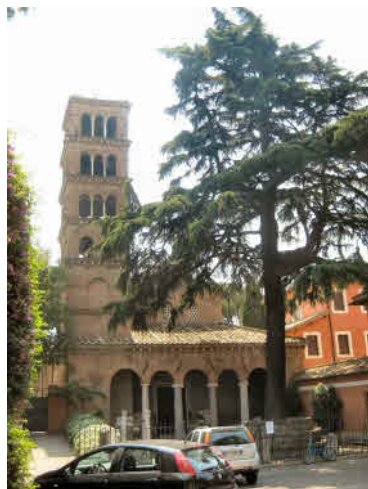
San Giovanni a Port Latina