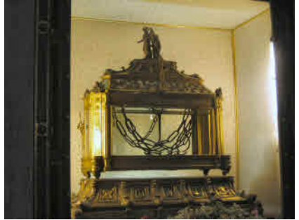
and the chains

This was another foundation on one of the main thoroughfares leading into the city; it stood on the northern slope of the Esquiline Hill, facing Subura, and close to some of the major buildings of the imperial city: the Templum Pacis and the Baths of Trajan. Relatively large among the tituli , it also dates from the time of Sixtus III, and appears to have been built with imperial support. There seems to have been an earlier church on this spot, but it was rapidly superseded by Sixtus's building, which incorporated substantial parts of its predecessor: remains of the original fenestration can be seen in the cloister of the adjacent monastery. The first church was dedicated to SS Peter and Paul, but it may be that the gift of St Peter's chains lay behind both the imperial patronage and the decision to replace the older building so quickly. In any case, once the church held the chains, the dedication to St Paul was dropped. The chains themselves, among Rome's most revered relics, are well displayed below the altar.