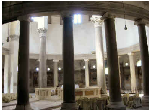
and the interior

With San Stefano Rotondo, we come to one of the most dramatic and beautiful churches in Rome. Built only a few years after the sack of Rome by the Vandals under Gaiseric, it stands on the top of the Celian hill, and is described by Hugo Brandenburg as “one of the most peculiar and magnificent buildings of Late Antiquity” 19 . The original church on this site, dedicated to the first martyr Stephen, saint developed, by the present building, which was dedicated by Pope Simplicius (s468-483) 20 .