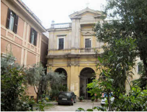
Santa Bibiana, the courtyard