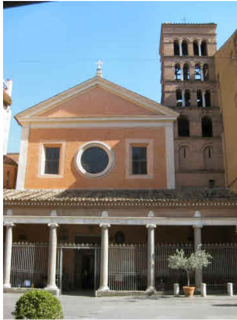
San Lorenzo in Lucina, the façade