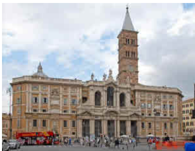
Santa Maria Maggiore, the façade 11

In terms of location, the church was built close by the Via Lata, the continuation down to the Forum of the Via Flaminia, a little north of the column of Marcus Aurelius, adjacent to the Ara Pacis of Augustus, and covering part of the same emperor's massive Horologium. The gnomon of this great sun-dial, originally an Egyptian obelisk, was still standing in 800 when the Einsiedler included it in his Itineraries, and though it was lost thereafter, it was rediscovered late in the 18 th century and re-erected in the Piazza di Montecitorio, some 100m south of its original position, where it still stands – with moreover a line of brass strips set into the paving to record the length of its shadow at different times of the year, so that it still retains part of its original function. One could hardly have found a more significant spot at which to declare Christianity's supersession of Imperial Rome.