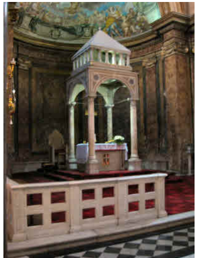
and the main altar

Sant'Agatha was founded by the Gothic general Flavius Ricimer in about 470, in the Subura quarter, between the Vicus Longus and the Vicus Patricius. It was a private rather than a public foundation, intended to serve the mainly Germanic and Gothic Arian community in Rome. It was eventually transferred to the Catholic community and given its present dedication under Gregory I (c. 590)