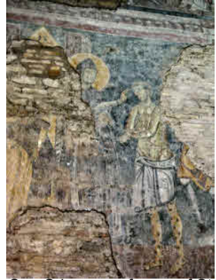
San Crisogono: fresco of St Benedict healing a leper

The Titulus Chrysogoni was situated in Trastevere, beside the main road coming in from the Porta Aurelia and leading directly to the Pons Aemilius (now