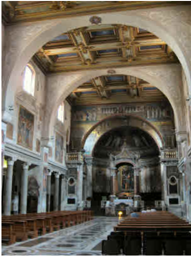
Santa Prassede, the nave