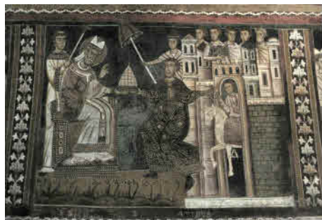
and the "Donation of Constantine" in the chapel of St Sylvester

This church stands just south of the old Via Tuscolana, on the northern slope of the Celian Hill, and in the area that used to be known as Caput Africae (indeed one of the streets leading down from here to the Colosseum is called Via Capo d'Africa to this day): once again, close to one of the principal thoroughfares leading in to the heart of the city. The earliest references call this church titulus Aemilianus, but it seems that the four crowned martyrs (who have not been clearly identified, but may have been stone-masons in Pannonia – now Hungary - who were killed for refusing to sculpt a statue of Aesculapius) were venerated here from an early date, and the present name has been in use since at least the 5 th century. There is no archaeological evidence for an earlier Christian building on the site: the church as we have it was installed in the great hall, already