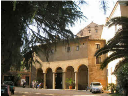
San Stefano Rotondo, the façade