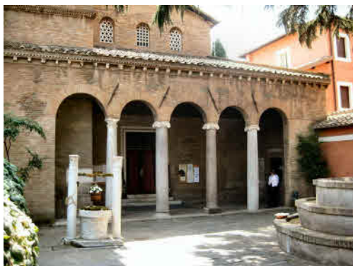
and the portico

This church, just within the walls at the southern edge of the city, is a gem and a joy. It is built of brick, and so modest that even its Romanesque campanile seems extravagant. It is set back from the road, and behind a small courtyard with an enormous pine tree and a little well.