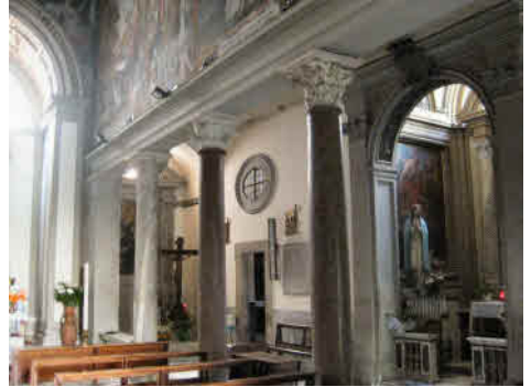
and the nave

This tiny and unobtrusive church lies at the mouth of a tunnel under the lines leading to Termini station, squeezed at an angle between the railway and the tram tracks – though in the past, it must have been more or less at right angles to the Via Tiburtina, which has entirely disappeared at this point (the Porta Tiburtina, now closed and completely out of use, is on the opposite side of the railway). The church does not seem to be easily accessible today, and no service times are posted; but a lucky encounter with a passing priest allowed me two minutes inside, enough to appreciate its tiny 3-aisled basilica shape, and its heterogeneous columns, which clearly belong to the original construction.