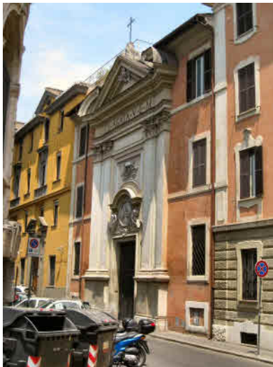
Sant'Agata dei Goti, the façade