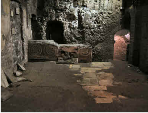
San Crisogono: vestiges of the original church below the present one