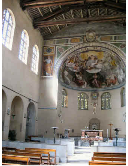
and the nave

From the outside at least, Santa Balbina is all that one could hope for in an early church. It has clean simple lines, is made of brick, and the windows have been restored with traditional transennae : a joy to the eye. It is perched on a little bluff of the Picolo Aventino behind, and overlooking, the Baths of Caracalla, so quite an out-of-the-way location. Perhaps this is why it was not noticed by the Einsiedler in 800. A notice on the gate gives very limited opening hours, and even then nobody turned up on the two occasions I tried to visit. However, a chance encounter with two determined (and Italian-speaking) English women secured access via the Casa di Riposo next door ... to reveal a church not unlike San Giovanni a Porta Latina (the next to be covered), though broader, and without side aisles: but the same bare walls with traces of ancient frescoes, and the roof-timbers visible. The alcoves either side of the nave, in which the