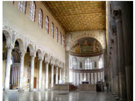
and the nave