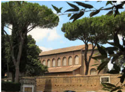
Santa Sabina, the exterior

The church was restored in the 8 th century under Hadrian I (s 772-795) and 1519, and the present church dates from the subsequent 16 th century rebuilding.