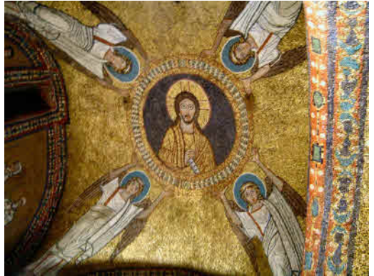
and the ceiling of the San Zeno chapel

This is one of the most delightful of Rome's early churches, located in a side street a few minutes walk from Santa Maria Maggiore; though only a fraction of the size, it quite makes up in interest. It is dedicated to Prassede the daughter of Senator Pudens and sister of Pudenziana, whose own church lies just on the other side of Santa Maria Maggiore, and which we covered in the previous article.